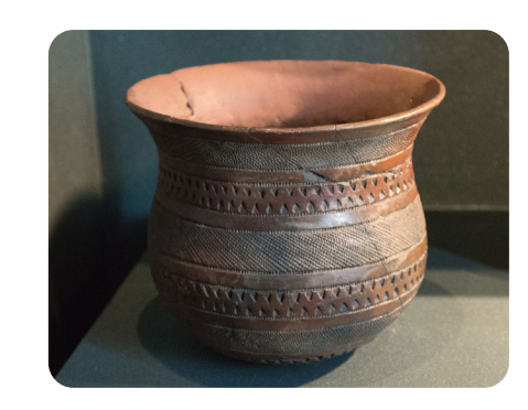
Bell Beaker pottery